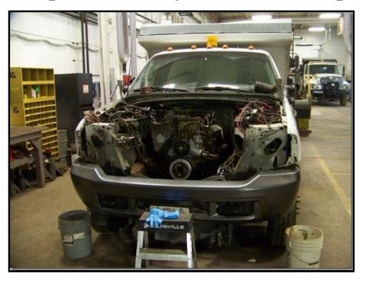
Complete Engine Rebuild in New Shop

The Street Department spent the first part of 2014 making the necessary modifications and moving into the front part of the old Randall building on S. Nelson Avenue. The move was completed in May. The Street Department now