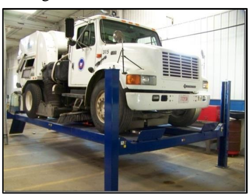
New Vehicle Lift

has all equipment under roof. In the past, much of the