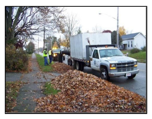
Leaf Crew in Action

The paving was performed by Roberts Paving in Hillsboro Ohio. The city crews repainted all street markings after the paving.